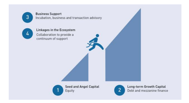
Figure 3. Key gaps for the 'missing middle' in Kenya

Actually, entrepreneurs are often unaware about the services dedicated to them and take time to navigate the support ecosystem, which resembles more of a maze to them. Specialization of service offerings, greater awareness raising and pro-active marketing towards attracting target clienteles – including outside of Nairobi - would help service providers position themselves within the continuum of financial and business support services from the early to growth stages of enterprise development. A few initiatives currently aim at bringing entrepreneurs and ecosystem stakeholders together through networks and platforms; however, these efforts remain limited and need to be scaled up.